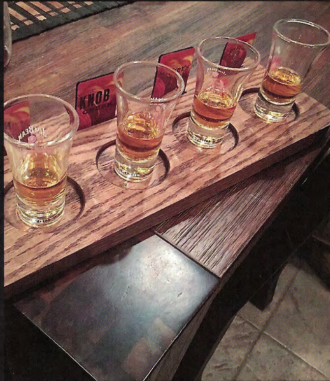
Whiskey One Eleven's plan includes allowing guests to design their own flight of craft whiskeys.